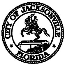
Exhibit 2 (Page 1 of 1)